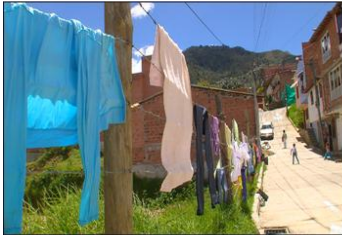
Town of Yarumal, Colombia.

10 March 2011. If you follow Alzheimer's disease research at all, chances are you have heard of the families in the South American nation of Colombia who comprise the largest known population stricken with early-onset autosomal-dominant Alzheimer's disease (ADAD). Passing relentlessly through the generations in a lineage of some 5,000 people, a single-nucleotide flaw in the presenilin-1 gene called the Paisa mutation is stalking some 25 extended families in the hilly Antioquia region of the northwest of the country. But you may not have fully caught on to how these families—after 30 years of giving time and tissue to research—have finally captured the sustained interest of researchers and drug companies around the world in a serious and broad-based way. That interest results from a combination of partnerships, new research, and media attention. It has created a new sense of hope among the families, which scientists and the pharmaceutical industry are now challenged to fulfill.