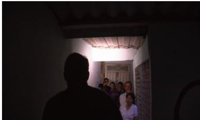
Colombian family with CNN cameraman.