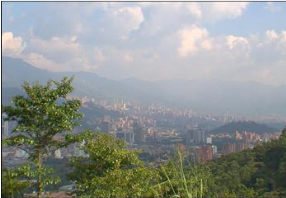
Medellin, Colombia.