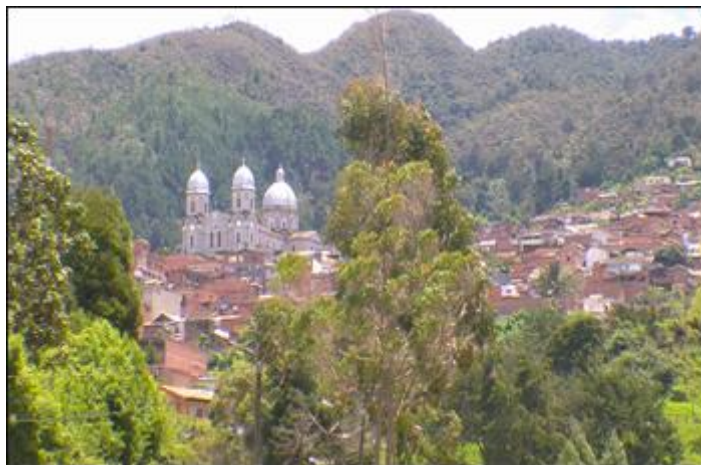
Yarumal, Colombia.